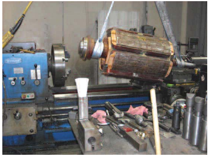
Ryazan Engine Lathe with Newall C80 2-Axes DRO. Part Name: Armature.

The Droop & Rein 4-axis HBM combined with the Newall DRO provides accurate measurements for duplicat-