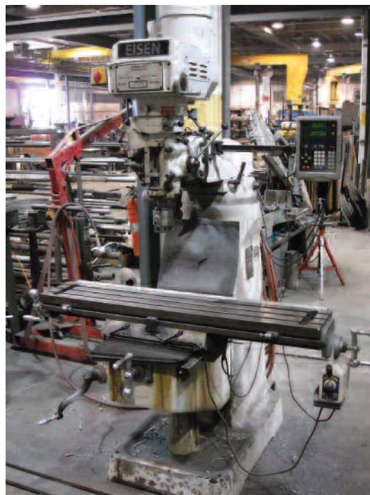
Eisen Vertical Milling Machine with Newall C80 2-axis DRO.

Mid States Oilfield Machine LLC 6501 Interpace St. Oklahoma City, OK 73135 405-672-4032 Fax: 405-672-4176