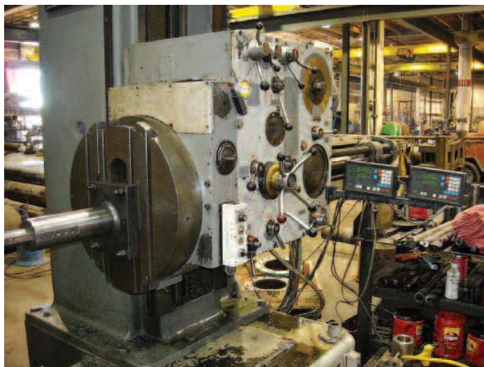
Droop & Rein Horizontal Boring Mill with twin Newall Topaz Mill 2-Axes DROs.

Mid-States currently performs turning, boring, milling and welding on most all major drilling rig components. The company repairs or manufactures shafts, housings, frames and all related oilfield equipment. The company was founded in 2005 by Bronco Drilling Co. to help facilitate the building, refurbishment and continued repair of the major components of Bronco's drilling rig fleet.